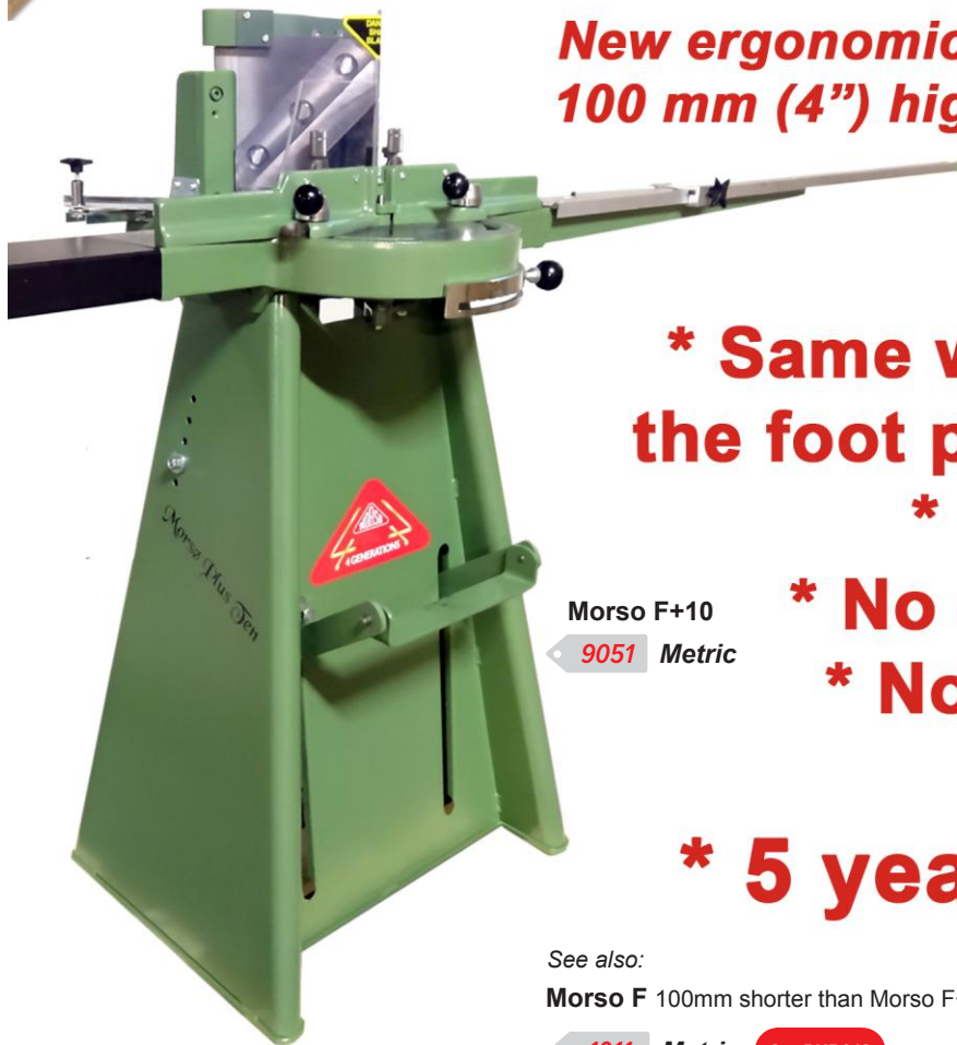
Morso F+10 9051 Metric

New ergonomic working height - 100 mm (4") higher than Morsø-F.